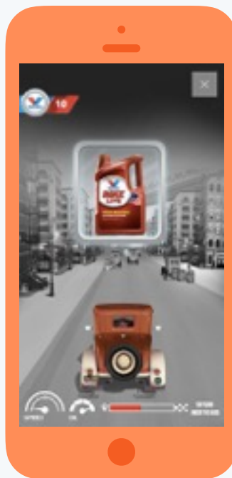
User plays the game within the ad