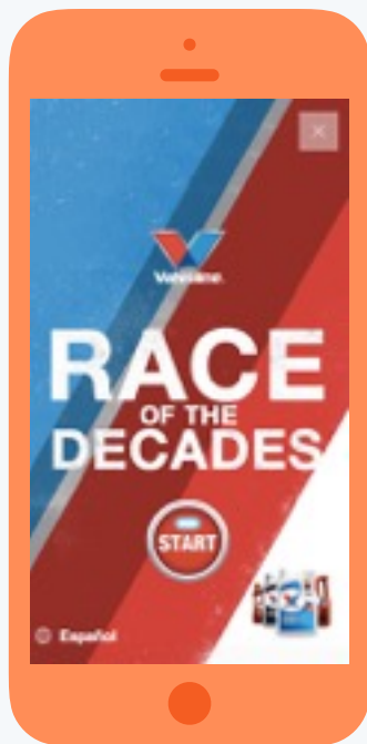
User is prompted to interact with an app or brand